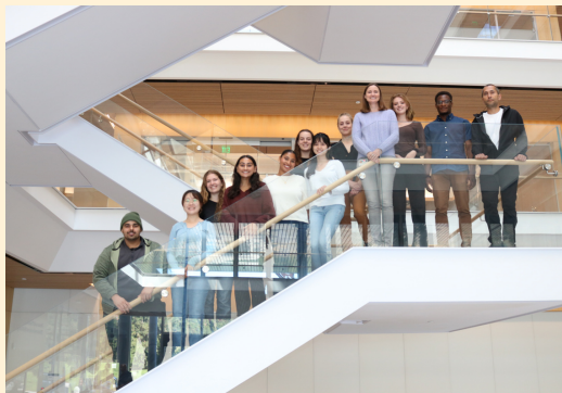
The Lab Team