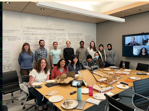
The lab team meeting with family members and carriers of genetic mutations